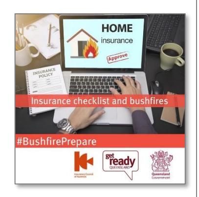
Filename: BushfirePrepare - Insurance checklist and bushfires

#BushfirePrepare #GetReadyQueensland #Insurance