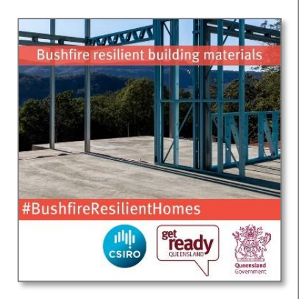
Filename: BushfireResilientHomes - Bushfire resilient building materials

#BushfireResilientHomes #ResilientHomes #GetReadyQueensland