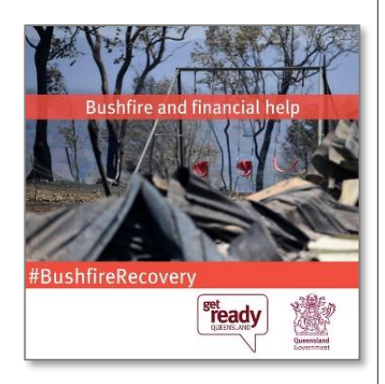
Filename: BushfireRecovery - Bushfire and financial help

#BushfireRecovery #GetReadyQueensland #Community Recovery