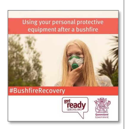
Filename: BushfireRecovery - Using your personal protective equipment after a bushfire

Image: Wearing a P2 protection respiratory mask to reduce amount of breathing PM2.5 particles from bushfire smoke.