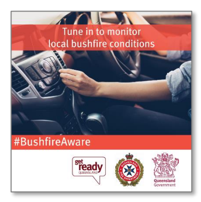
Filename: BushfireAware - Tune in to monitor local bushfire conditions