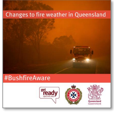
Filename: BushfireAware - Changes to fire weather in Queensland

#BushfireAware #GetReadyQueensland #BushfireWeather