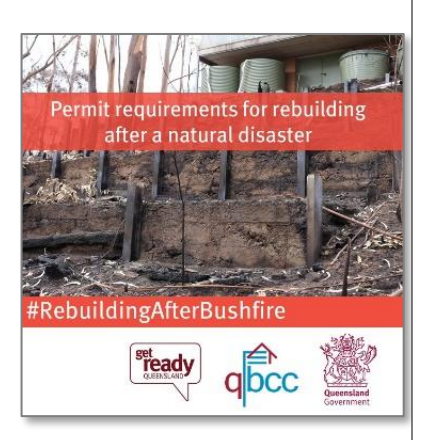
Filename: Bushfire -RebuildingAfterBushfire - Permit requirements

Filename: Bushfire -RebuildingAfterBushfire - Find licensed tradespeople for bushfire repairs