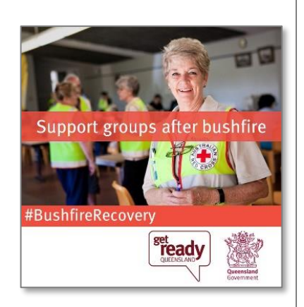
Filename: BushfireRecovery - Support groups after bushfire

#BushfireRecovery #GetReadyQueensland #CommunityRecovery #SmallBusinessDisasterHub