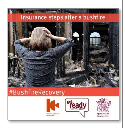
Filename: BushfireRecovery – Insurance steps after a bushfire

#BushfireRecovery #Insurance #GetReadyQueensland