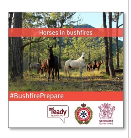
Filename: BushfirePrepare - Horses in bushfires