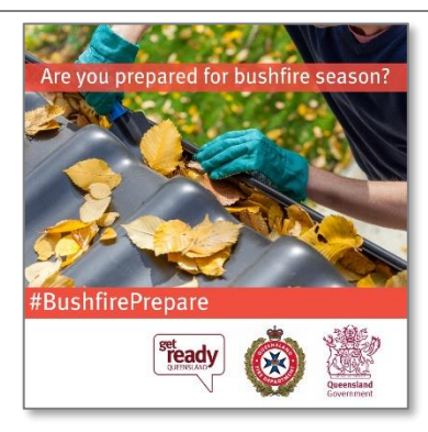
Filename: BushfirePrepare - Are you prepared for bushfire season