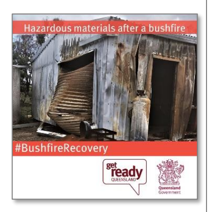
Filename: BushfireRecovery - Hazardous materials after a bushfire