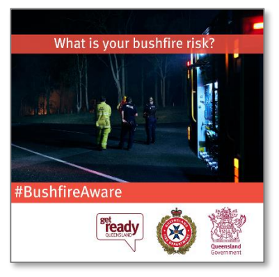
BushfireAware - What is your bushfire risk