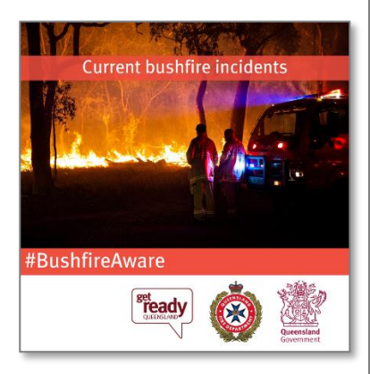
Filename: BushfireAware - Current bushfire incidents