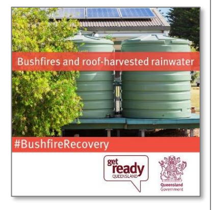
Filename: BushfireRecovery - Bushfires and roof-harvested rainwater

\#BushfireRecovery\ \#GetReadyQueensland