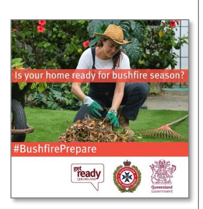
Filename: BushfirePrepare - Is your home ready for bushfire season