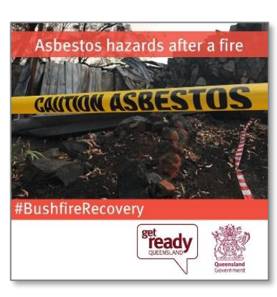
Filename: BushfireRecovery - Asbestos hazards after a fire

\#BushfireRecovery\ \#GetReadyQueensland