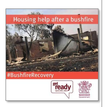
Filename: BushfireRecovery - Housing help after a bushfire

#BushfireRecovery #GetReadyQueensland #CommunityRecovery