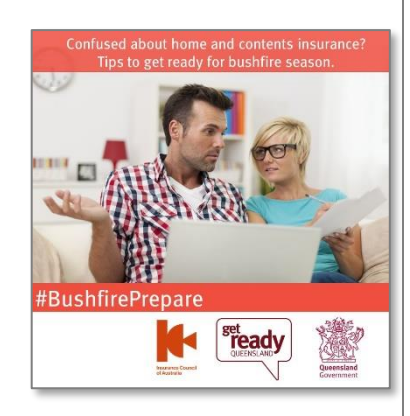
Filename: BushfirePrepare - Confused about home and contents insurance - Tips to get ready for bushfire season

#BushfirePrepare #GetReadyQueensland #Insurance