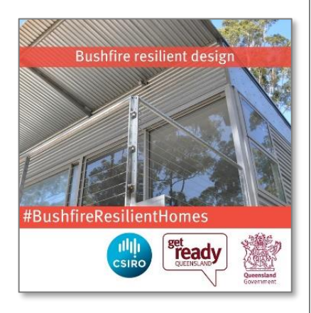
Filename: BushfireResilientHomes - Bushfire resilient design

#BushfireResilientHomes #ResilientHomes #GetReadyQueensland