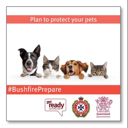
Filename: BushfirePrepare - Plan to protect your pets