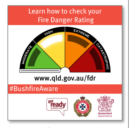
Filename: BushfireAware – Learn how to check your Fire Danger Rating

Image: Australian Fire Danger Rating System