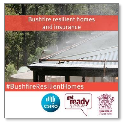
Filename: BushfireResilientHomes - Bushfire resilient homes and insurance

#BushfireResilientHomes #ResilientHomes #GetReadyQueensland