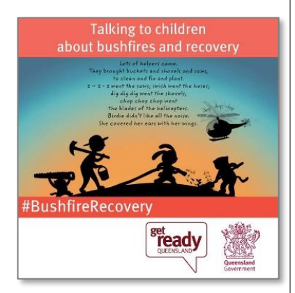
Filename: BushfireRecovery - Helping children understand bushfires