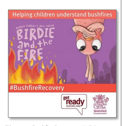
Filename: BushfireRecovery - Helping children understand bushfires

https://www.childrens.health.qld.gov.au/chq/ourservices/mental-health-services/qcpimh/natural-disasterresources/storybooks/