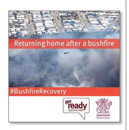
Filename: BushfireRecovery - Returning home after a bushfire

Image: Bushfires, Peregian, Queensland, 2019.