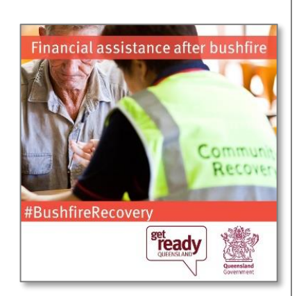
Filename: BushfireRecovery - Financial assistance after bushfire

#BushfireRecovery #GetReadyQueensland #Community Recovery