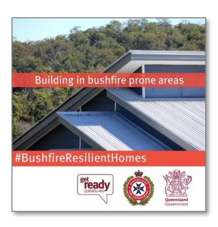
Filename: BushfireResilientHomes - Building in bushfire prone areas

#BushfireResilientHomes #ResilientHomes #GetReadyQueensland