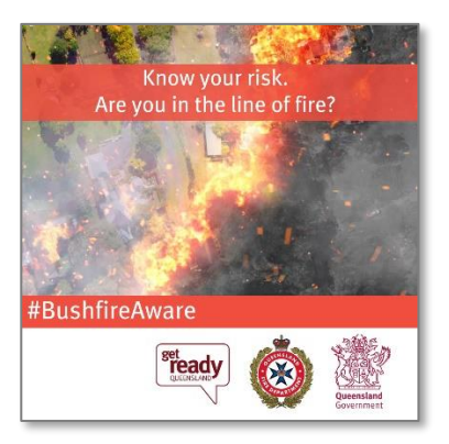
Filename: BushfireAware - Know your risk - Are you in the line of fire