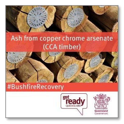
Filename: BushfireRecovery - Ash from copper chrome arsenate (CCA timber)

Image: Wooden poles treated with (CCA) preservative containing copper, chromium and arsenic.