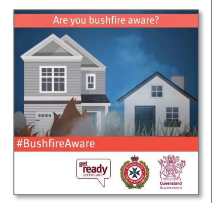
Filename: BushfireAware - Are you bushfire aware