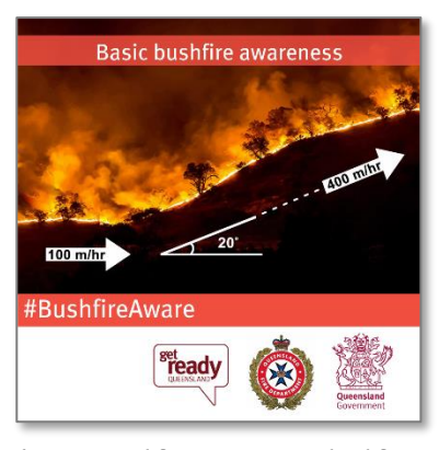
Filename: BushfireAware - Basic bushfire awareness

Image: The most dangerous position on the fireground is to be uphill of an advancing fire front.