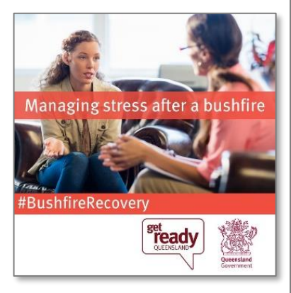
Filename: BushfireRecovery - Managing stress after a bushfire

#BushfireRecovery #GetReadyQueensland #CommunityRecovery