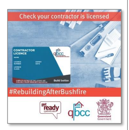
Filename: Bushfire -RebuildingAfterBushfire - Check your contractor is licensed

#RebuildingAfterBushfire #GetReadyQueensland