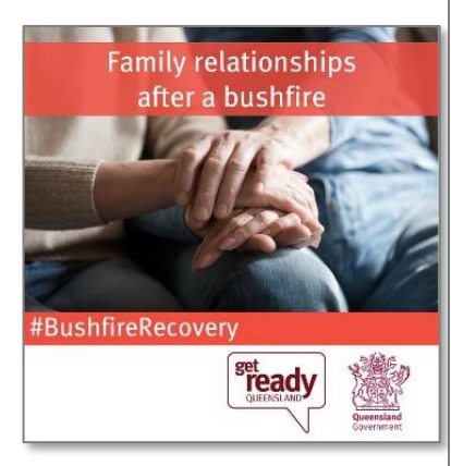
Filename: BushfireRecovery - Family relationships after a bushfire

#BushfireRecovery #GetReadyQueensland #CommunityRecovery