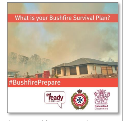
Filename: BushfirePrepare – What is your Bushfire Survival Plan

https://www.fire.qld.gov.au/prepare/bushfire/will-you-stay