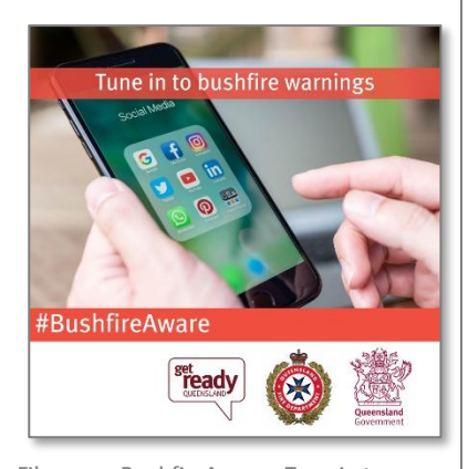
Filename: BushfireAware - Tune in to bushfire warnings

#BushfireAware #GetReadyQueensland #BushfireWarnings