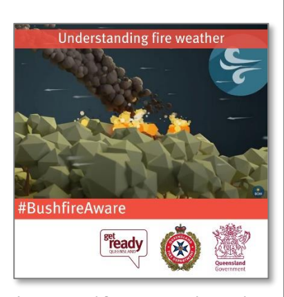
Filename: BushfireAware - Understanding fire weather

Watch the Bureau's 'Understanding Fire Weather' video at: <a href="http://www.bom.gov.au/weather-services/fire-weather-centre/bushfire-weather/index.shtml">http://www.bom.gov.au/weather-services/fire-weather-centre/bushfire-weather/index.shtml</a>