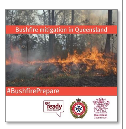
Filename: BushfirePrepare - Bushfire mitigation in Queensland

#BushfirePrepare #GetReadyQueensland #TheBurningQuestion