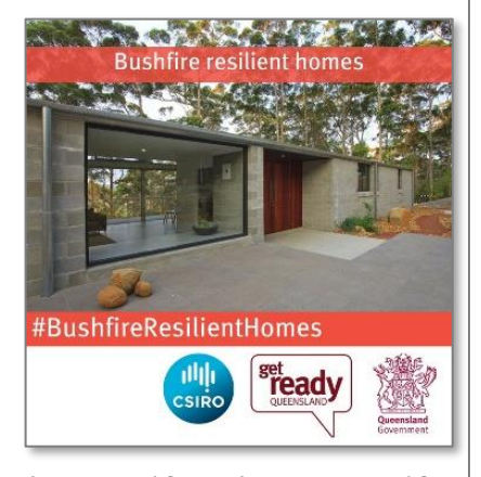
Filename: BushfireResilientHomes - Bushfire resilient homes

Image: Bushfire resilient home (Source: Andrew Halsall).