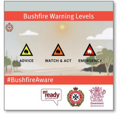
Filename: BushfireAware - Bushfire Warning Levels