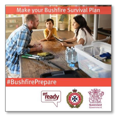
Filename: BushfirePrepare - Make your Bushfire Survival Plan

#BushfireSurvivalPlan #BushfirePrepare #GetReadyQueensland