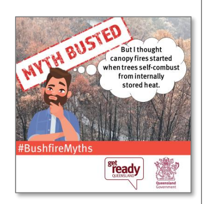
Filename: BushfireMyths - But I thought canopy fires started when trees selfcombust from internally stored heat