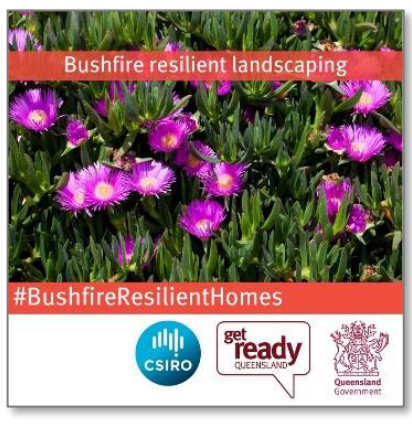
Filename: BushfireResilientHomes - Bushfire resilient landscaping

#BushfireResilientHomes #ResilientHomes #GetReadyQueensland