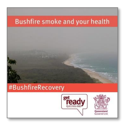
Filename: BushfireRecovery - Bushfire smoke and your health