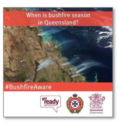
Filename: BushfireAware – When is bushfire season in Queensland