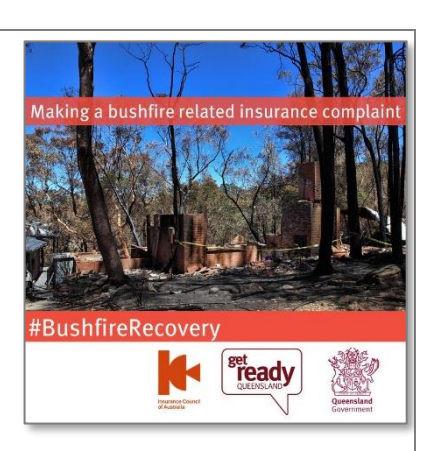
Filename: BushfireRecovery - Making a bushfire related insurance complaint

#BushfireRecovery #Insurance #GetReadyQueensland