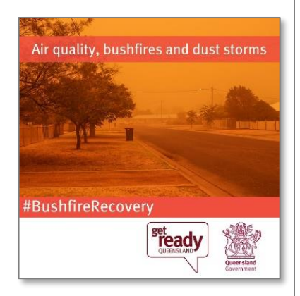
Filename: BushfireRecovery - Air quality, bushfires and dust storms

#BushfireRecovery #DustStorm #GetReadyQueensland Image: Dust storm at St George, Queensland, 11 January 2020.