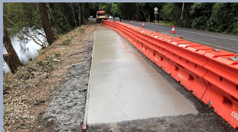
Image: (Left) Currumbin Creek Road – damage site. (Right) Currumbin Creek Road – emergency works.