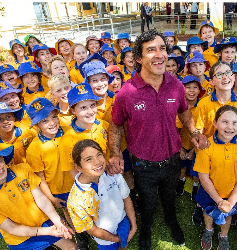
Image: Get Ready Ambassador Johnathan Thurston and students from Milton State School at the 2021 Get Ready Launch.

The Get Ready Facebook page also received more than 50,000 impressions throughout the week, with more than 1,800 engagements. The most successful post was our new campaign video, targeting recent arrivals to Queensland and featuring Get Ready Ambassador Johnathan Thurston.