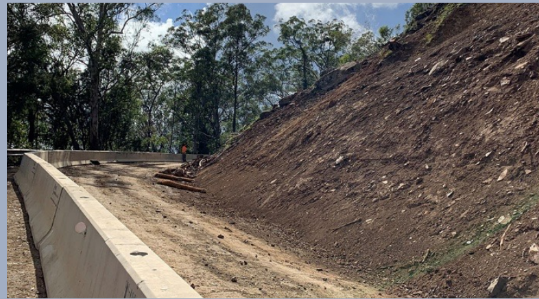
Image: (Left) Tamborine Mountain Road – landslide site. (Right) Tamborine Mountain Road – emergency works.

Planning and design works are underway for repairs to other South Coast roads. Works will include fixing unstable slopes above and below the road, replacing damaged road surfaces, repairing damaged road shoulders, and repairing damaged culverts and bridges.