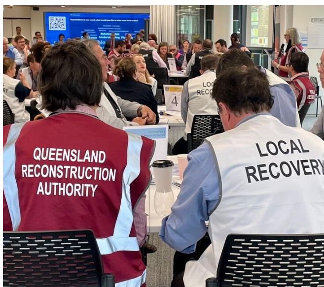
Figure 2: FLOOD-Ex21 exercise – 18 October 2021.