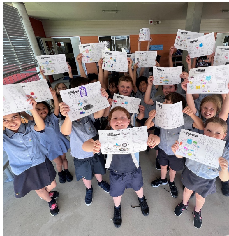
Image: Year 3 students from Bounty Boulevard State School displaying their posters on how to Get Ready as part of their entry into the schools competition.

See the Get Ready website to see this year's campaign materials.