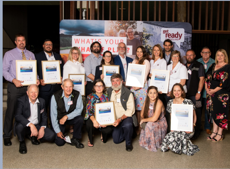
Image: The 2021 Get Ready Queensland Resilient Australia Awards winners.

Selected projects will progress to the National Resilient Australia Award ceremony in late 2021.