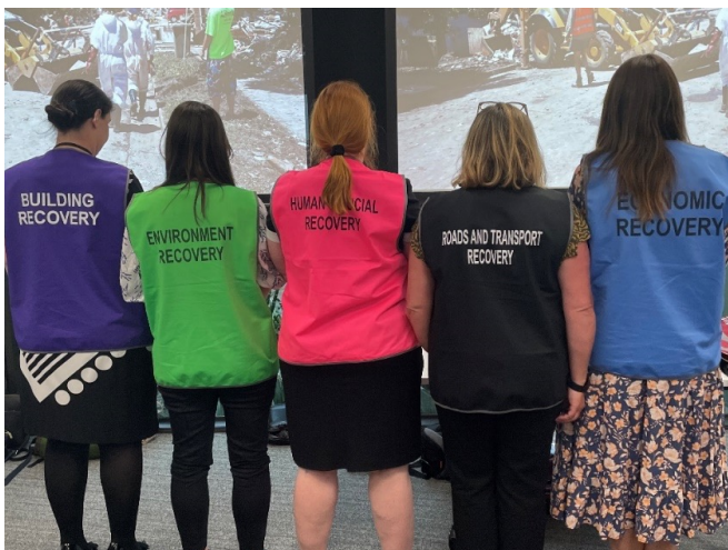
Image: State FRG representatives – FLOOD-Ex21 exercise.

The Recovery Officers Network working group held its first meeting on Thursday, 7 October 2021 to develop the concept and outline a strategy for the network's implementation. The working group will continue to meet monthly to further develop the concept and discuss the most effective means of implementation.